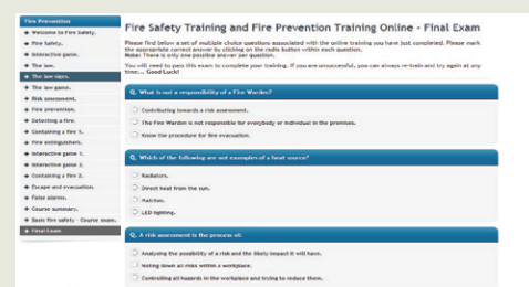
Final Exam – Certificates Provided.

Those responsible for workplaces must provide staff with suitable, sufficient and appropriate training to help prevent the outbreak of fire.